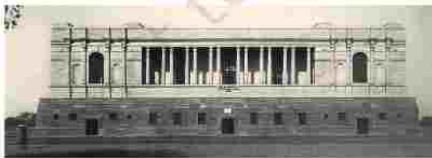
Fig. 4 – The National Archives of India came up in the 1920s

In the early years of the nineteenth century, these documents were carefully copied out and beautifully written by calligraphists – that is, by those who specialised in the art of beautiful writing. By the middle of the nineteenth century, with the spread of printing, multiple copies of these records were printed as proceedings of each government department.