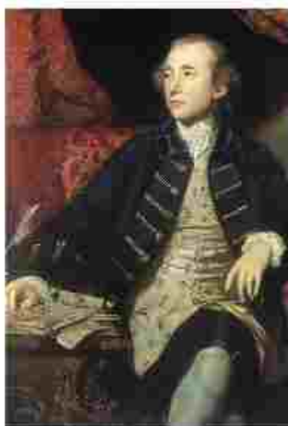
Fig. 3 – Warren Hastings became the first Governor-General in 1773. While history books narrated the deeds of Governor-Generals, biographies glorified them as persons, and paintings projected them as powerful figures.

Mill thought that all Asian societies were at a lower level of civilisation than Europe. According to his telling of history, before the British came to India, Hindu and Muslim despots ruled the country. Religious intolerance, caste taboos and superstitious practices dominated social life. British rule, Mill felt, could civilise India. To do