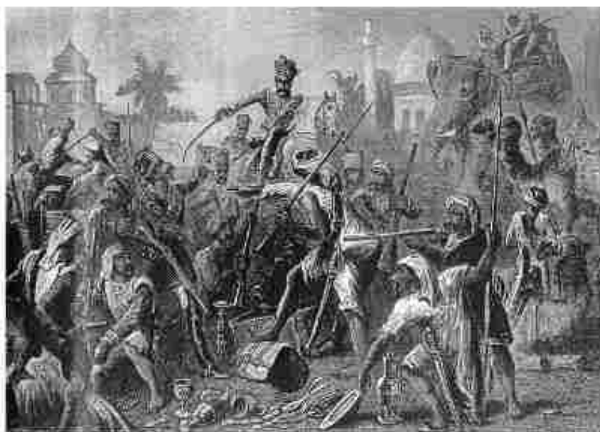
Fig. 7 – The rebels of 1857

Images need to be carefully studied for they project the viewpoint of those who create them. This image can be found in several illustrated books produced by the British after the 1857 rebellion. The caption at the bottom says: "Mutinous sepoys share the loot". In British representations, the rebels appear as greedy, vicious and brutal. You will read about the rebellion in Chapter 5.