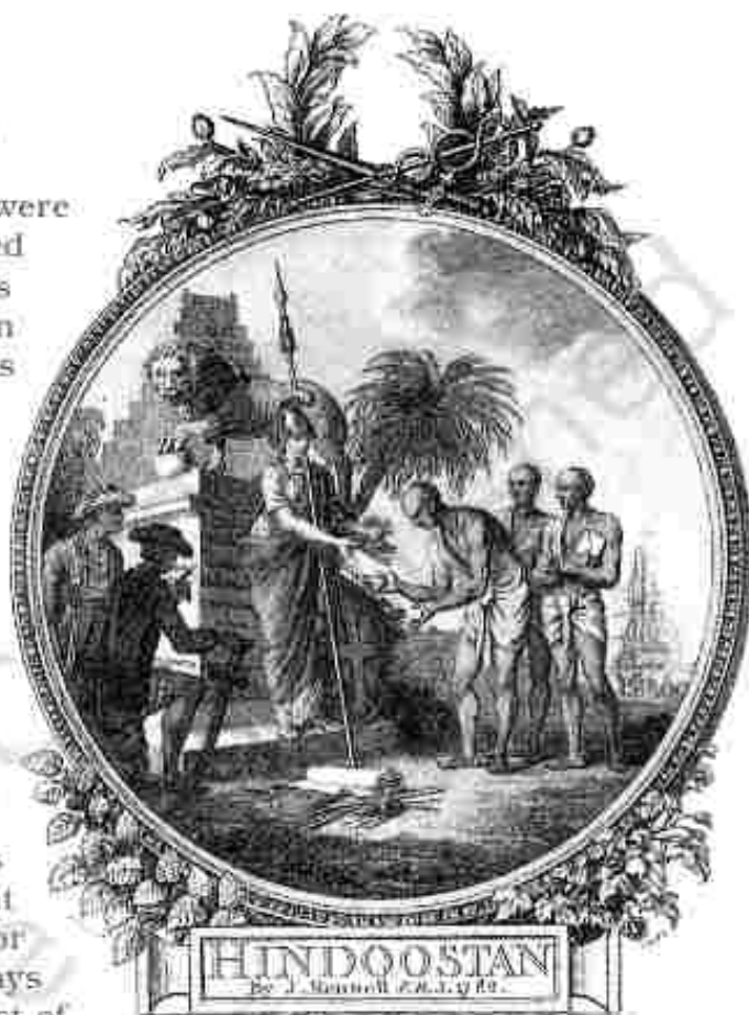
Fig. 1 – Brahmins offering the Shastras to Britannia, frontispiece to the first map produced by James Rennel, 1782.

Living in the world we do not always ask historical questions about what we see around us. We take things for granted, as if what we see has always been in the world we inhabit. But most of us have our moments of wonder, when we are curious, and we ask questions that actually are historical. Watching someone sip a cup of tea at a roadside tea stall, you may wonder – when did people begin to drink tea or coffee? Looking out of the window of a train you may ask yourself – when were railways built and how did people travel long distances before the age of railways? Reading the newspaper in the morning you may be curious to know how people got to hear about things before newspapers began to be printed.