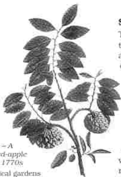
Fig. 5 – A custard-apple plant; 1770s

Botanical gardens and natural history museums established by the British collected plant specimens and information about their uses. Local artists were asked to draw pictures of these specimens. Historians are now looking at the way such information was gathered and what this information reveals about the nature of colonialism.